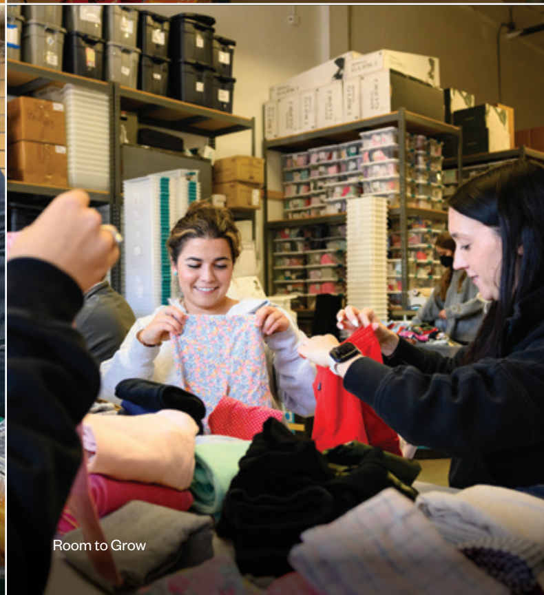
Room to Grow