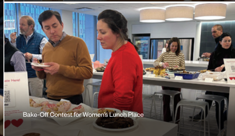
Bake-Off Contest for Women's Lunch Place