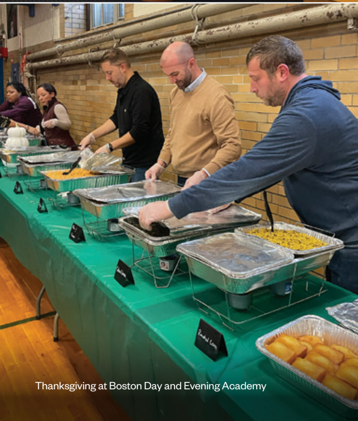
Thanksgiving at Boston Day and Evening Academy