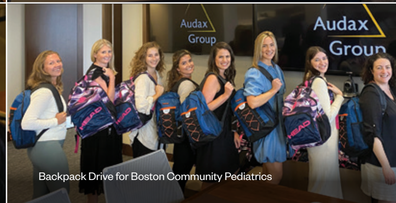
Backpack Drive for Boston Community Pediatrics