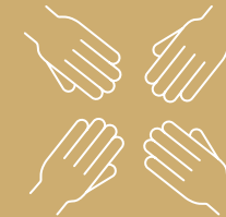
SOCIAL SUPPORT & SERVICES