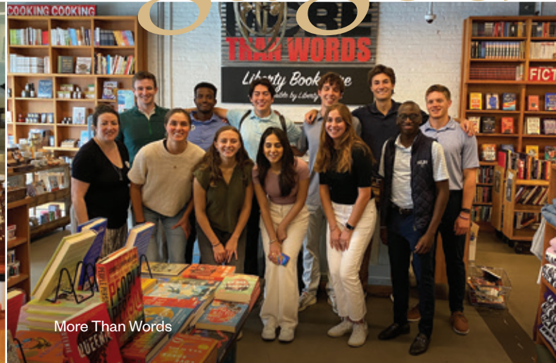
More Than Words