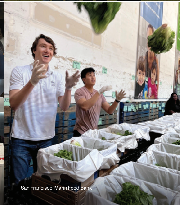
San Francisco-Marin Food Bank