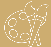
ARTS & CULTURAL PROGRAMS