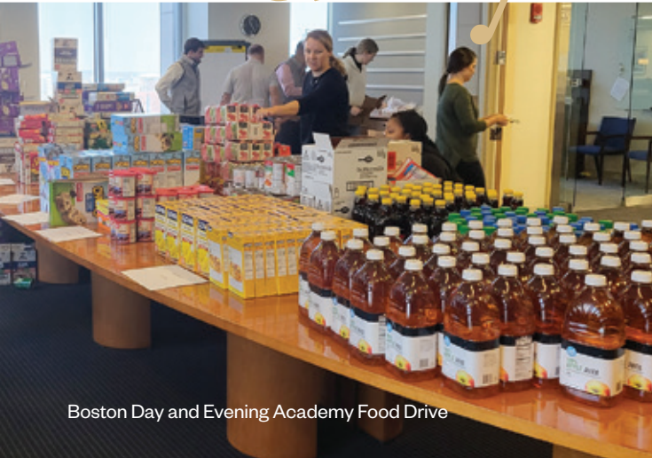
Boston Day and Evening Academy Food Drive

Audax Private Equity Team Members Contributed 817 Hours to Local Causes in 2023