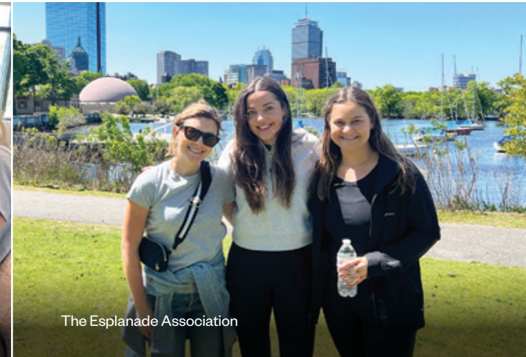
The Esplanade Association