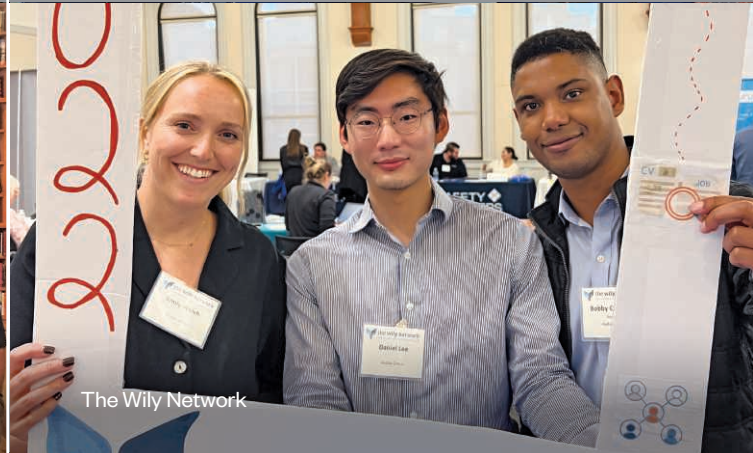
The Wily Network