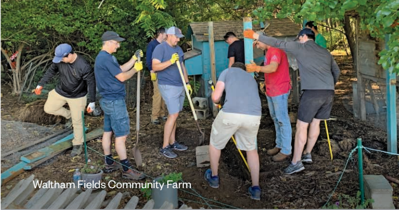
Waltham Fields Community Farm