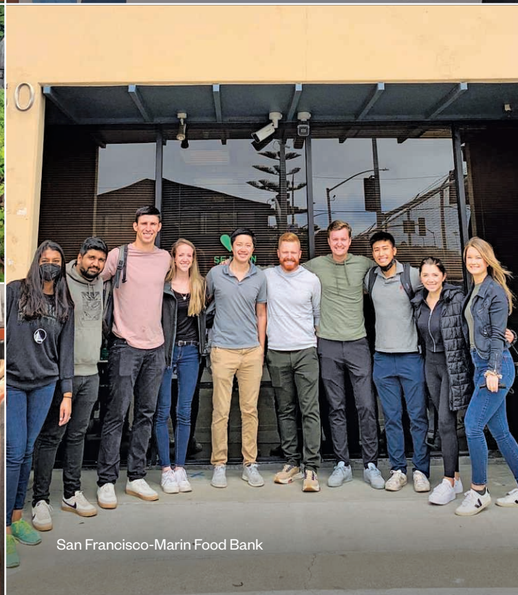
San Francisco-Marin Food Bank