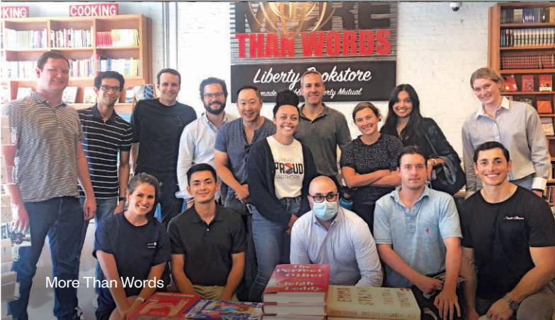
More Than Words