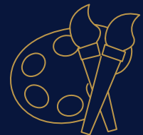
Arts & Cultural Programs