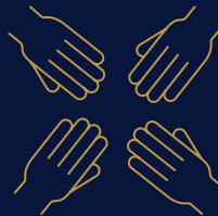
Social Support & Services