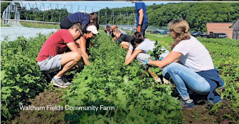
Waltham Fields Community Farm