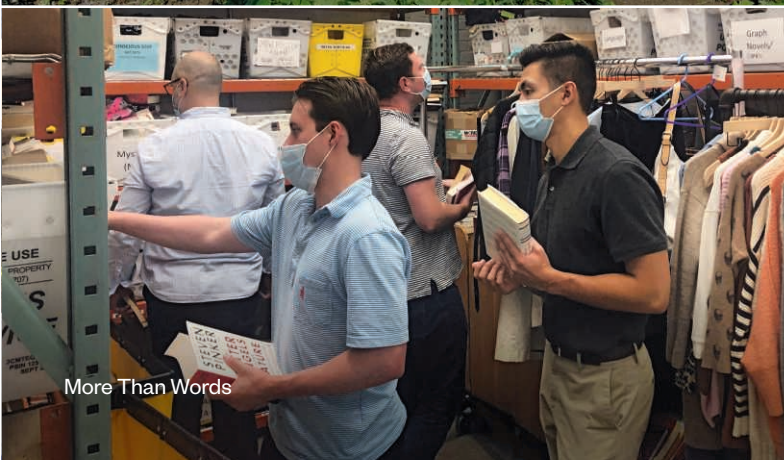
More Than Words